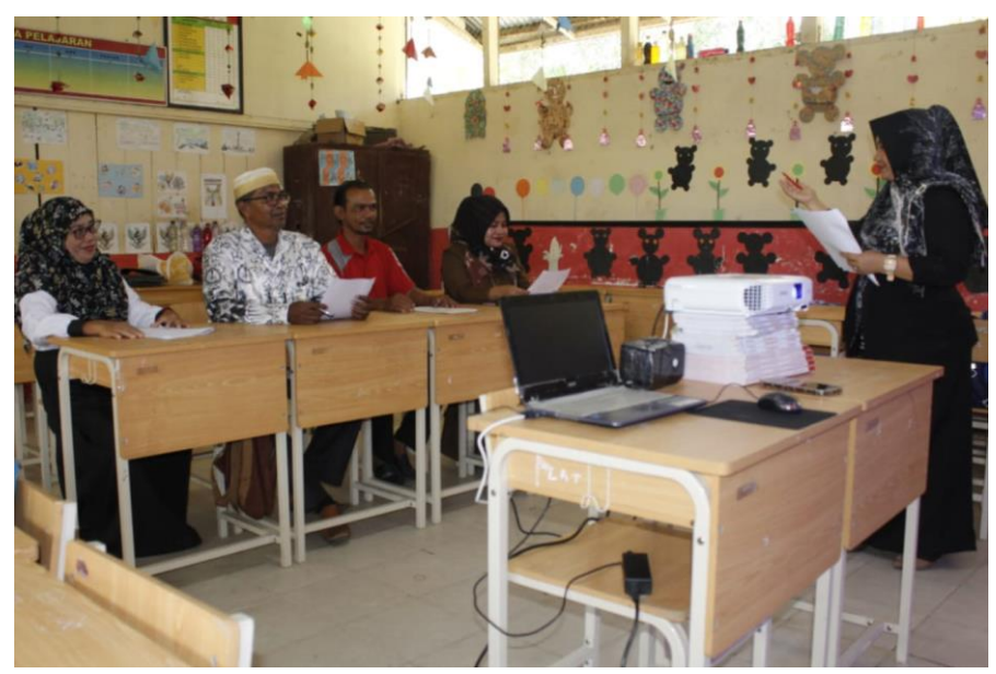
Figure 1. Delivering the seminar material

Feedback obtained from participants reveals a heightened understanding of the relevance of well-designed LKPD in the teaching and learning process. Many felt an increased confidence in adding effective worksheet tactics into their lesson plans. The practical examples and case studies suited to the local context resonated well with the instructors, addressing specific difficulties found in SD Negeri Bandar Khalifah. Furthermore, post-seminar assessments and questionnaires demonstrated a positive shift in the teachers' impression of their capacity to provide engaging and relevant LKPD. The majority of respondents indicated a better grasp of the ideas underpinning efficient worksheet design and expressed enthusiasm for using these tactics in their classes. This shows a tangible impact on the professional growth of the educators involved.