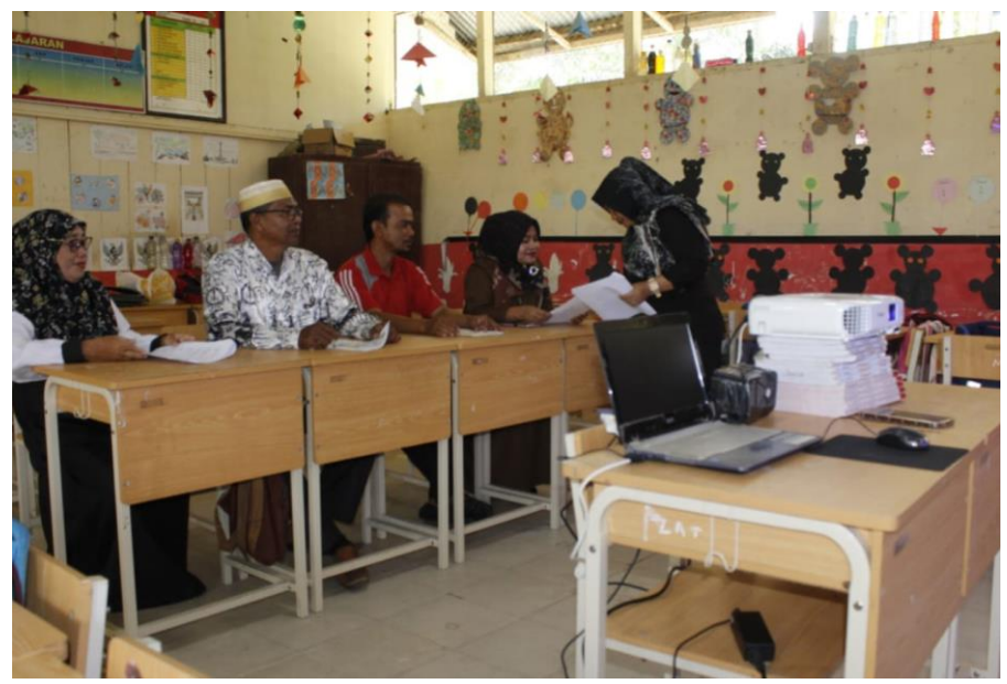
Figure 2. Guiding participants in understanding the material

The beneficial consequences of the seminar transcend beyond the immediate impact on instructors, resonating in the better educational experiences for students in SD Negeri Bandar Khalifah. The enthusiasm and better abilities among instructors are translating into more engaging and effective learning environments, producing a positive ripple effect among the school community. Notably, anecdotal information from teachers indicates that kids are reacting well to the deployment of new LKPD practices. Teachers observed enhanced student involvement, participation, and a deeper comprehension of the subject matter. This connection between teaching practices and student outcomes underscores the premise that investing in teacher professional development significantly improves the quality of education received by children.