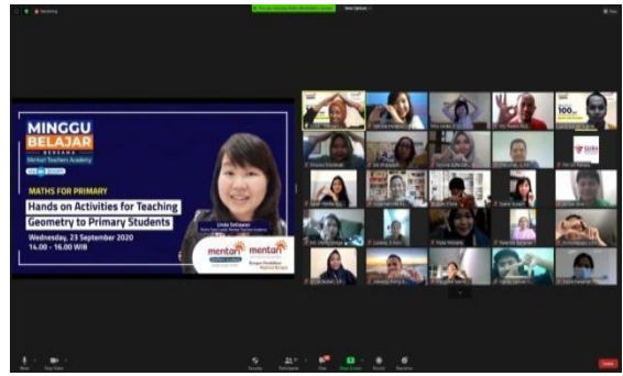
Figure 4. Online Training Images

After the supervision activities were carried out, the principal followed up on the results of these activities. [4] state that there are several steps in the follow-up to the results of academic supervision, including: