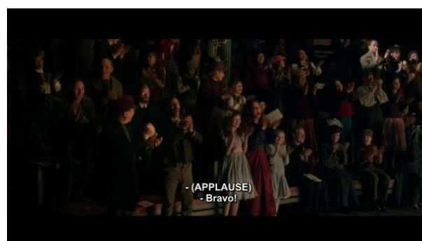
Figure 5. The audience applauds the circus performance. (00:30:19-00:30:42)

Figure 3 shows the circus members preparing by wearing costumes that match their characters and expertise in the circus. They believe in their competence to perform and entertain audiences. Figure 4 presents how the circus performers carry out their duties to amuse, and the results of their shows get praise from the viewers, as illustrated in Figure 5. Therefore, the pictures and previous explanations are related to Spreitzer's theory (1995), namely psychological empowerment as intrinsic motivation divided into 4 cognition,