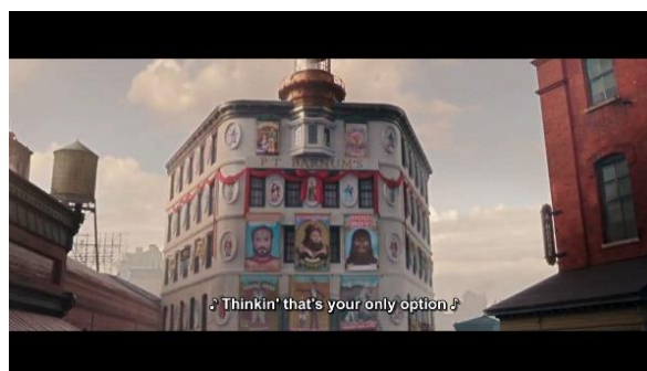
Figure 2. Posters of Each Circus Performer. (00:24:14-00:25:45)

Figure 1 clearly shows that P.T Barnum makes a pamphlet and pastes it on the wall and tree with his two daughters. The pamphlet contains information that Barnum wants to make a circus filled with odd-looking people. Then, through the conversation, Barnum tries to find the freak person who is a bearded woman. Barnum invites her to join his circus because he is attracted by the woman's vocal abilities and uniqueness. Barnum attempts to gather and interview the registrants before forming a circus group called the Barnum Circus. In Figure 2, Barnum also displays a large poster of each circus performer to introduce their skills and attract the public attention to see the Circus performance. Thus, it is according to Bond & Keys' (1993) theory that the community leaders prepare the community member through their human resources and skill to develop their self-capacity. P.T Barnum in this