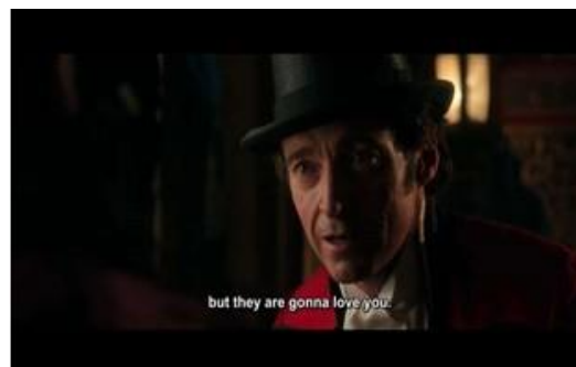
Figure 9. Barnum Gives Strength Through His Motivational Words. (00:26:44-00:26:52)