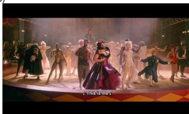
Figure 7. The Barnum Circus members defended themselves in front of the crowd. (00:58:30-00:58:35)

I am brave, I am bruised I am who I'm meant to be, this is me (00:56:32-01:00:08)