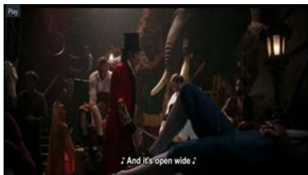
Figure 3. Circus Performers Prepare for The Show (00:25:57-00:26:28)