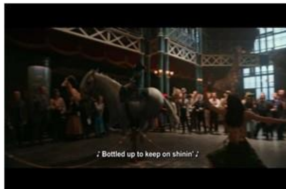
Figure 6. Circus Members Sing A Song During Their Performance. (00:27:27-00:27:34)

'Cause once you see it, oh you'll never, never be the same We'll be the light that's turning Bottle up and keep on shining (00:25:26-00:00:28:10)